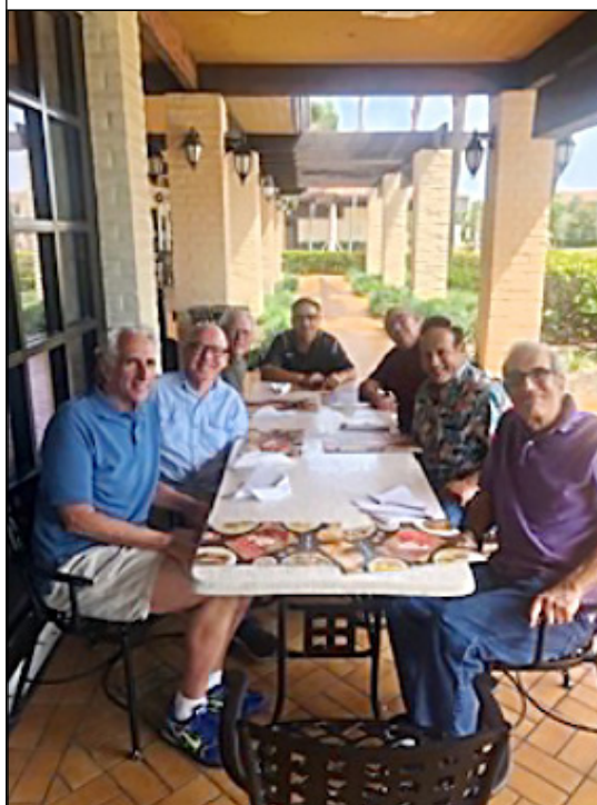
On May 3, 2022 in Jupiter, Florida: Seven brothers from six different chapters met for lunch.