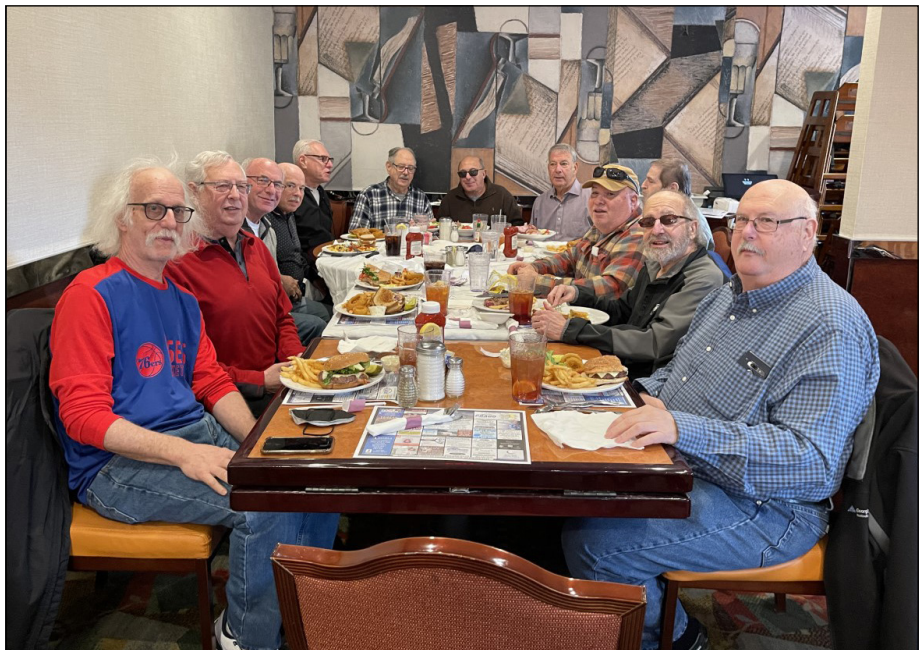
Lambda Chapter alumni lunch with some of the 1970-1972 members.